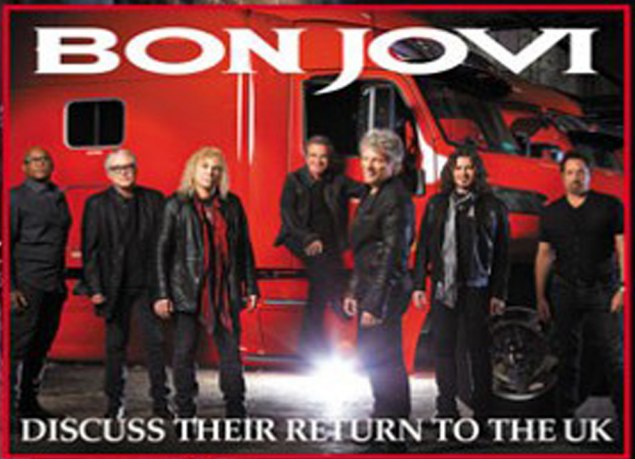
DISCUSS THEIR RETURN TO THE UK

Francis Rossi • Geddy Lee • Avantasia Queensrÿche • Steve Hackett • Dream Theater Yngwie Malmsteen • Todd Rundgren And many more!